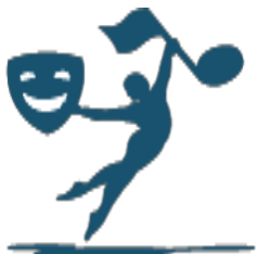
Melcombe Dance & Drama Studio

Tuesday 9th December at 10 am and 2 pm Years 5 & 6 Concert